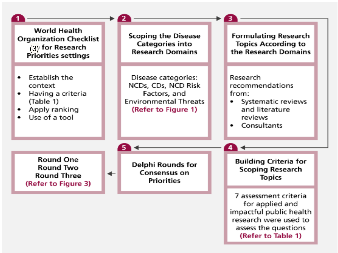
Figure 3: Gulf CDC research prioritization framework

Participants in the first two rounds came from diverse backgrounds from all 6 gulf countries' ministries of health, while only field experts in (communicable disease, non-communicable diseases, environmental and public health experts) contributed to Round Three ( Figure 3 ).